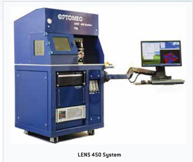
LENS 450 System

The all-new LENS 450 system offers a low cost entry to metal Additive Manufacturing. With a 100mm cubed working volume, 400W fiber laser and full LENS control software, the LENS 450 gives the user the same process as the industry-proven LENS 850R and MR-7, but with a smaller footprint and at a lower cost.